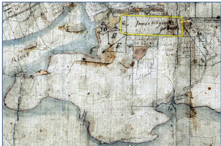
Falmouth Foreside with Wyman's tract in yellow (1732) 8

The next chapter in the story of Tidewater Farm began in 1729 when the Town of Falmouth granted "90 acres on Squitteryussett Creek in New Casco" (Falmouth) to James Wyman. The land was on the east side of the creek. 7