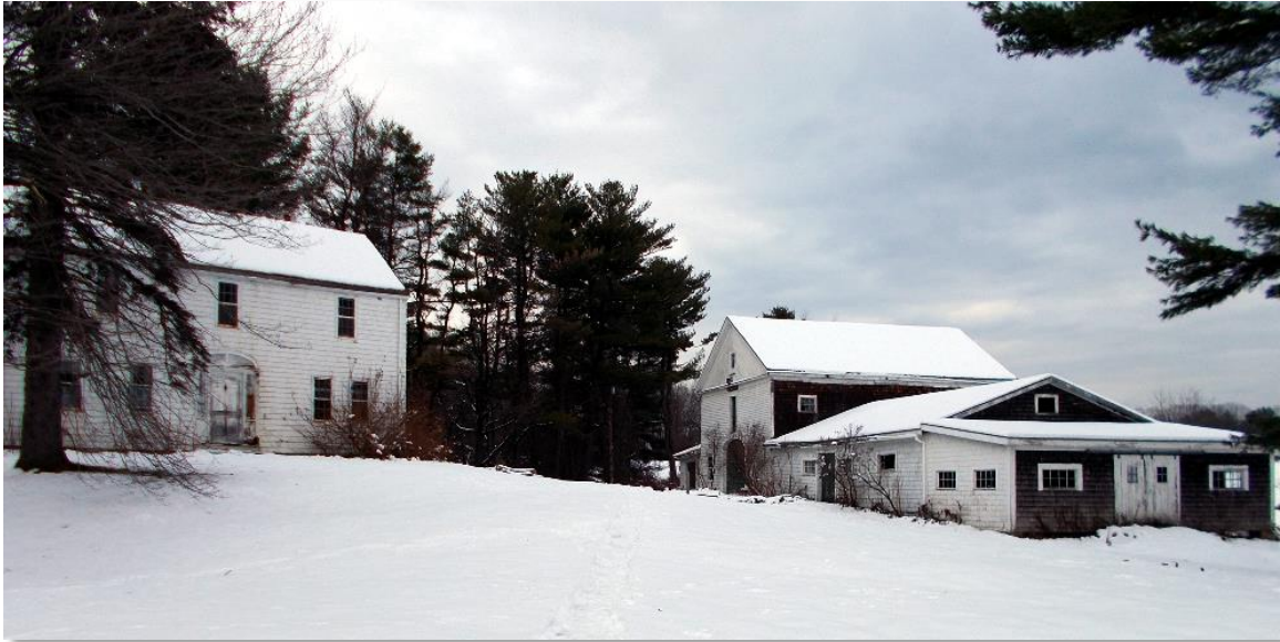
Tidewater Farm (2014)

Summary. The story of Tidewater Farm is the story of Falmouth. It is the story of immigrants extending back to the first English settlers of our town. It is a story involving some of our most prominent citizens over the centuries. The story illuminates the close ties between the people who lived on the farm and the broader community. Tidewater Farm connects us to our town's maritime and agricultural heritage.