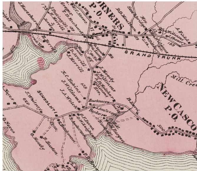
Falmouth Foreside (1871) 37