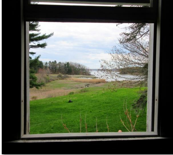
Looking towards Portland from the Farmhouse

The Moodys or Merrills would have been shocked by this view through a front window of the Tidewater farmhouse.